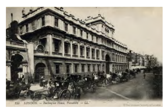
An early postcard of Burlington House

are always welcome — £20 pays for a year's membership for one. If you can help us to expand the scheme, either with funds or by proposing more candidates, please contact the Administrator at the address below.