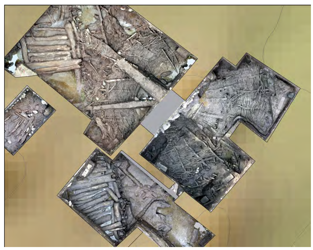
Composite photogrammetric view of the trackway and one of the roundhouses at Black Loch of Myrton.

location on a peaty island in a small loch; this has ensured that the organic remains of the roundhouses, a trackway and the palisades have been preserved, as well as the occupation surface. The settlement is precisely dated by dendrochronology so that we can trace its evolution over three major episodes from the mid-fifth century BC until the latter half of the third century BC. An array of innovative and integrated analyses has provided detailed evidence for living conditions and the use of space within the roundhouses. The focus of this lecture will be the occupation of the settlement, its chronology, construction and possible function. The cultural context of the settlement will be discussed and we will explore the perennial question — why live out on the water?