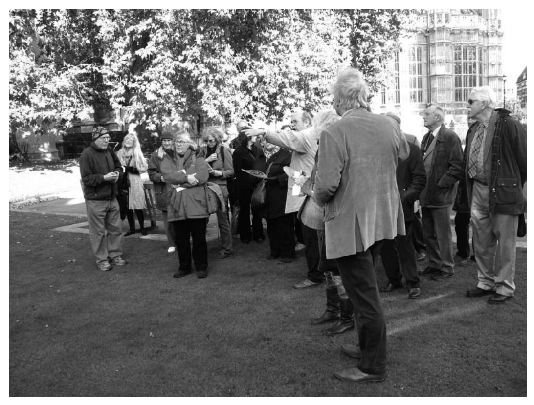
Explaining the topography (AQ)

Little Dean's Yard, while Tim conjured up a veritable wonderland for us to add in our imagination to what we could see.