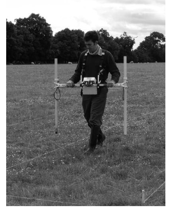
Geophysical survey taking place at Bagendon

A geophysical survey of the Late Iron Age complex at Bagendon (Gloucestershire) undertaken in 2008–9 aimed at contextualising previous small-scale excavations which have taken place there and revealed a first-century AD 'industrial' area. These excavations are currently the focus of a post-excavation project. In 2010 further geophysical survey was conducted using high-resolution geophysics, better to