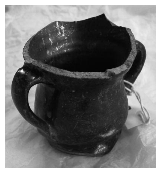
Cistercian-type necked cup or tyg from Wednesbury (DH)

ICPS was highly successful in identifying separate, chemical, fabric groups for each production centre and in some cases for different production sites within a centre. ICPS also pinpointed the source of particularly the Cistercian-type vessels at two monastic consumer sites used as test cases,