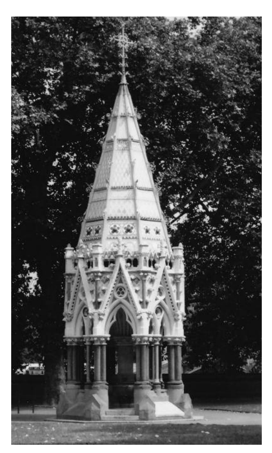
The Buxton Memorial Fountain (ER)