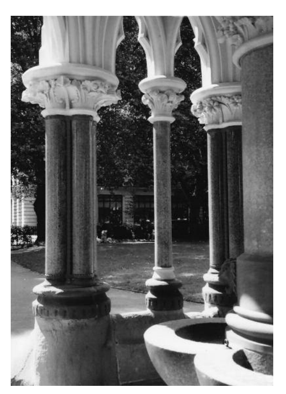
Frost-damage to the Pennant Sandstone (ER)

Here surely there are a range of different stones to whet the appetite of budding geologists. But there is more to learn from this Teulon fantasia. When we teach architects simple geology to observe when