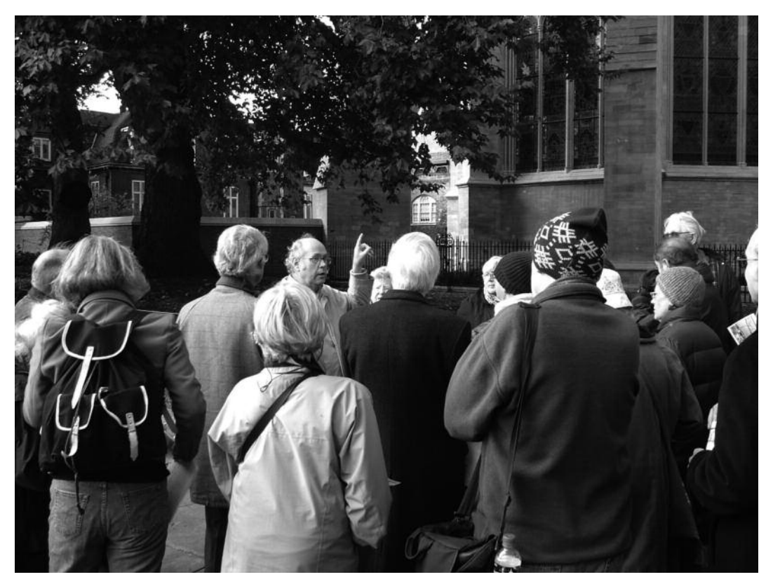
Describing the Henry VII chapel (AQ)

Tatton-Brown's capable hands and he had the intriguing aim of elucidating the building history of Thorney Island. From the very start he conjured up the invisible from the visible by indicating the boundaries of the gravel island lying between the twin courses of the Tyburn, now underground, as they drained into an un-embanked river Thames. Giving greater substance to the island's lost fabric, he inhabited it with a distinguished role-call of famous names, starting with St Dunstan and ending (though not precisely) with Alice Liddell - a nice contrast. In this way we progressed from the public hurlyburly of Westminster Abbey's eastern and northern precinct to the private seclusion of