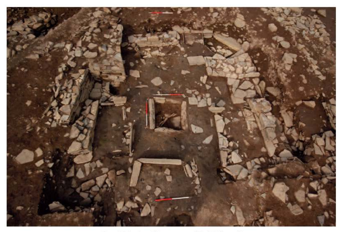
Central chamber of Structure 10 (H A Whymark)

Work within Structure 10, the monumental building (c. 25 \times 20 \text{ m}) , concentrated on its interior. This revealed that this structure had a much more complex history than previously envisaged. Although exhibiting a cruciform plan in its later life, its original plan was a square with rounded corners, much like the later houses at Skara Brae and Structure 8 at the Barnhouse settlement. However, the stonework within this early phase is quite possibly some of the finest Neolithic construction in north-west Europe, with extensive use of pick dressing. Although one stone 'dresser' had previously been recognised opposite the entrance passage it would now seem likely that Structure 10 potentially had four dressers, one on each wall. This may support the idea that dressers had a more esoteric religious function, as reflected in Structure 10 itself. In its later phase of use, one corner of Structure 10 revealed evidence for a production area for pigments that had previously been