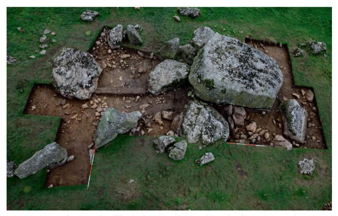
Garn Turne: the capstone has fallen (to the right) pulling over the uprights

event, and the dates have calibrated to the period of c. 170-50 cal BC (95% probability). This date span is also now potentially much more compatible with a modern view of the dating of the pottery (as noted during the recent archive assessment). As a result the new scientific dating has potentially made an extremely significant contribution towards providing a more precise chronological framework for this major site, highlighting the importance of obtaining independent dating for similar assemblages. We hope to continue with research on the remainder of the finds, and then compare these data with evidence from analogous sites across the country.