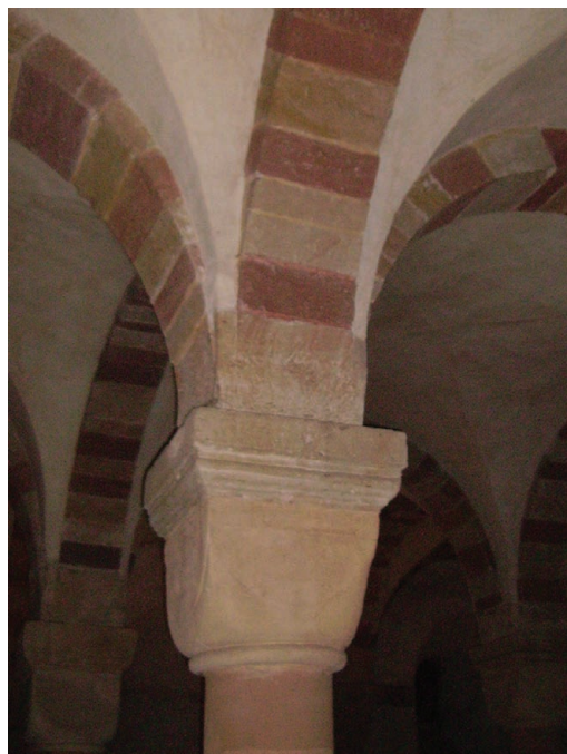
Capital, Crypt of Speyer Cathedral (Immanuel Giel)

appearing rude for us to make up for lost time by curtailing an introduction.