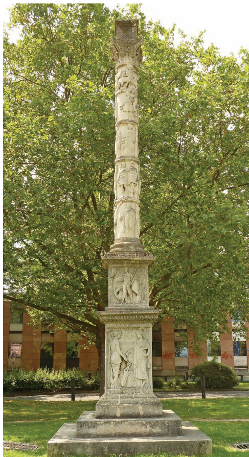
The Jupiter column, Mainz

post for shipping on the Rhine and to the North Sea.