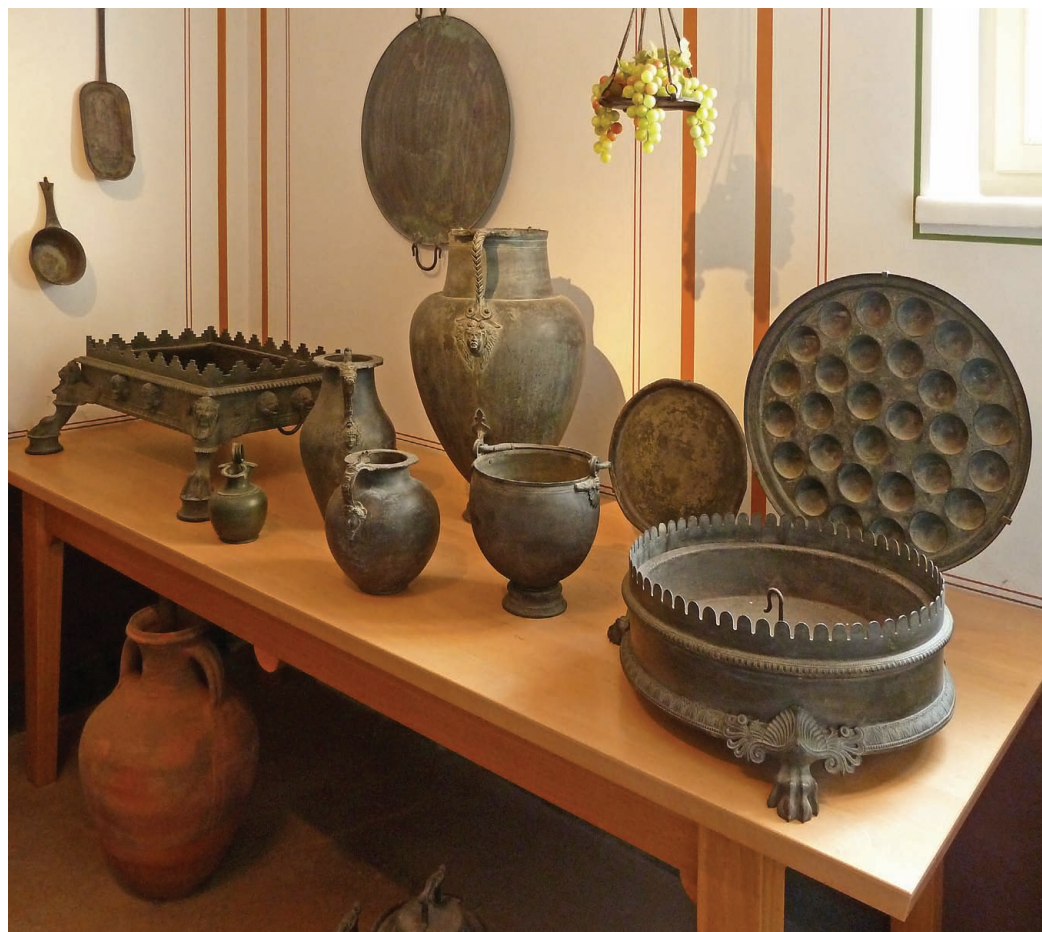
Roman kitchen equipment at the Pompeianum (M O'B)

The day of departure left time only for a little last minute shopping or for a walk in the neighbourhood of the hotel. Frankfurt had been good to us. The hotel was comfortable and the friendly and helpful staff had done their best to meet all our requests. The hotel had provided us with breakfasts