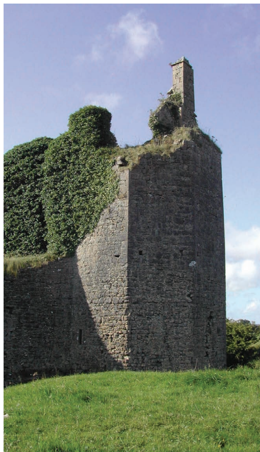
Ballintober Castle, Northwest tower

the Trust continue to advance our understanding of castles. The high calibre of the projects that the Trust supports (and the number of good projects that we had to turn down) shows there is much work still to do in the area of castle studies, and this is even more difficult with the continued financial restraints on traditional funding bodies.'