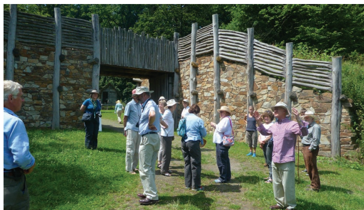
Reconstructed entrance gate at Dunberg (AW)

Dunsberg was next on the itinerary, an immense hill fort occupied from the eighth to the