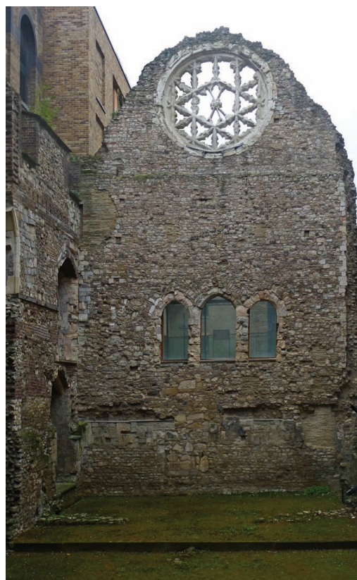
The west wall of the Great Hall of the Bishop of Winchester's palace

We crossed the High Street and walked down the steps to Southwark Cathedral. Started as a convent in the sixth century, it became an Augustinian Priory in the early thirteenth century. At the dissolution it became the parish church and by the nineteenth century was more or less in ruins. Almost everything externally visible today is Victorian, but at its heart it is medieval. From here St Thomas' Hospital was founded in the early twelfth century. The area was one of religious foundations and big town houses in the late medieval period. We skirted the Cathedral to St Mary Ovary dock and a first feeling of docklands and the area's important trading past. Just beyond the dock on Winchester Square stands all that remains of the Bishop of Winchester's palace, the