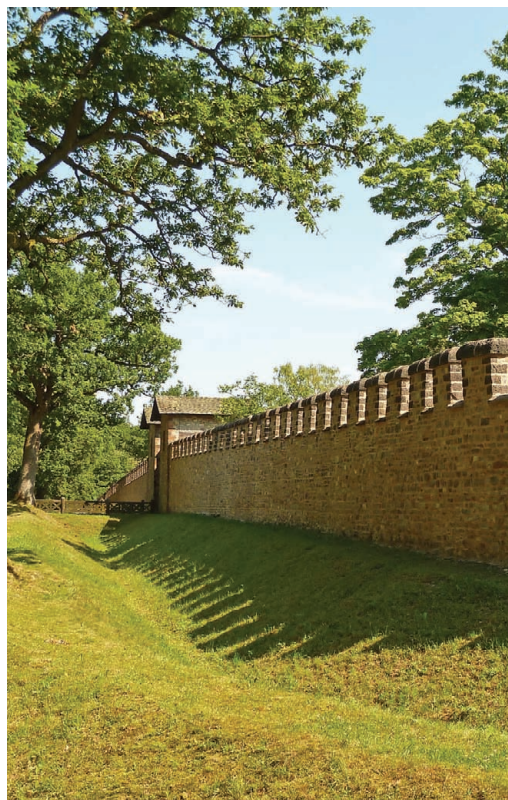
Reconstruction of the walls of Saalberg (MO'B)

Passing on the way the only World Heritage public convenience, which should have been dedicated to the memory of Vespasian, the party was able to venture beyond the Roman limes into barbarian territory and back again. Notices warned of the dangers of sheep ticks, which apparently cause limes disease. The Mithraeum to the south