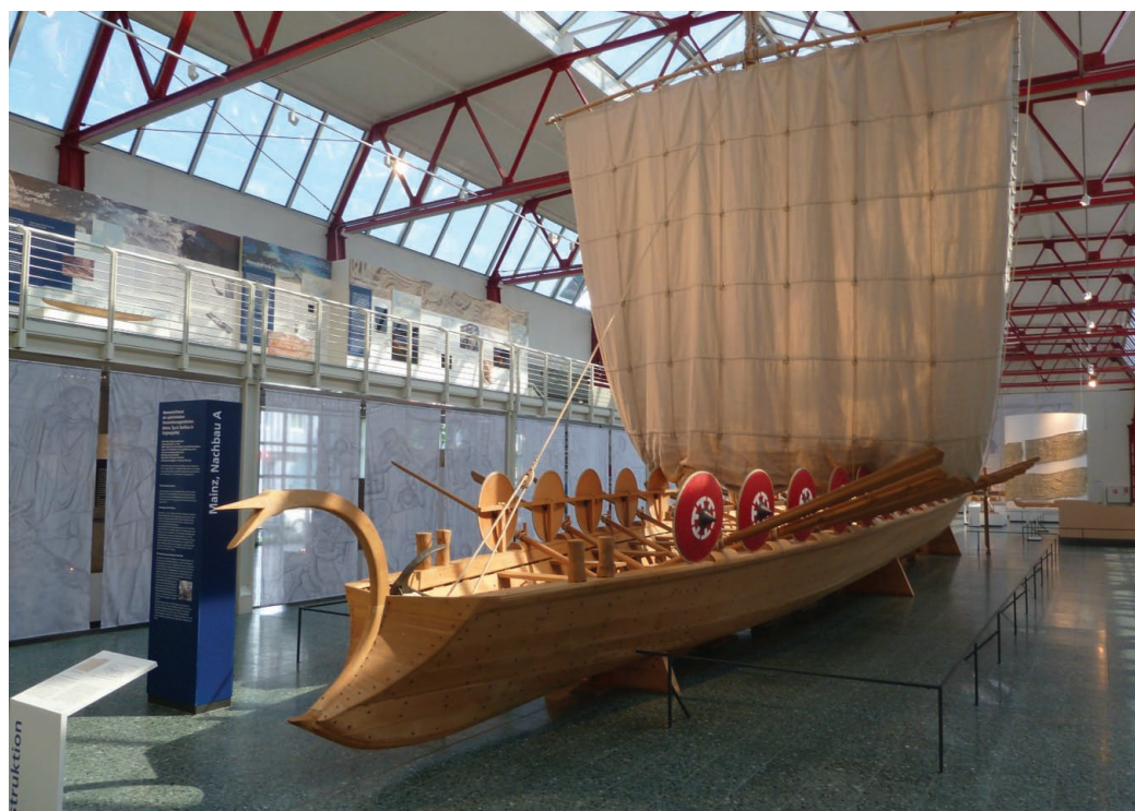
Oak replica of navis lusoria based on 4th-century remains, Mainz Ship Museum

Tuesday was the day for Mainz, which was no doubt a disappointment to those archaeologists who like their attractions to be roofless, but a feast for everyone else. Roman Mogontiacum was a station of great importance to the Roman army, garrisoned by two legions, and a major staging