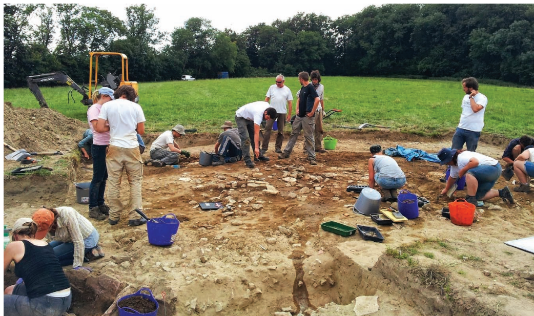
Teffont: uncovering the building outside the shrine enclosure (MH)

BP) in the other. In the summer of 2013, we undertook two weeks of fieldwork and additional post-excavation analysis. The fieldwork aimed systematically to investigate these areas of high potential. In the western bay, a grid of 0.5 \times 0.5 m test pits was dug either by hand or by induction dredge. Pits were spaced initially at 5 m and then 2.5 m over the areas of highest potential. The area outside the grid was systematically sampled by hand cores. Ten pits in total were dug, recovering 75 lithics, including relatively fresh examples. The artefacts clearly clustered within an area of less than 5 \times 5 m; however, they were found spread throughout a layer of silty gravel which also had modern glass mixed in down to 10–15 cm burial depth. Therefore, notwithstanding the fresh nature of many of the finds, the assemblage is most likely reworked. The peat layer in the eastern bay was also test pitted (3 pit transect, 5 m spacing) to characterise the peat stratigraphy. This indicated that its offshore margin is eroded down, but inshore, a thicker sequence of peat and organic clay is buried under seabed sand. Four additional 0.5 \times 0.5 m samples were block-lifted and excavated on dry land. No artefacts were found, although small quantities of charcoal were noted in a sandy layer towards the base of the peat. Identification of wood remains