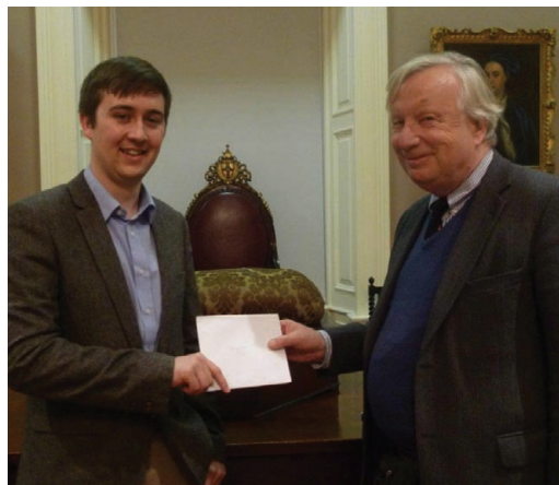
Presentation of the Masters' dissertation award