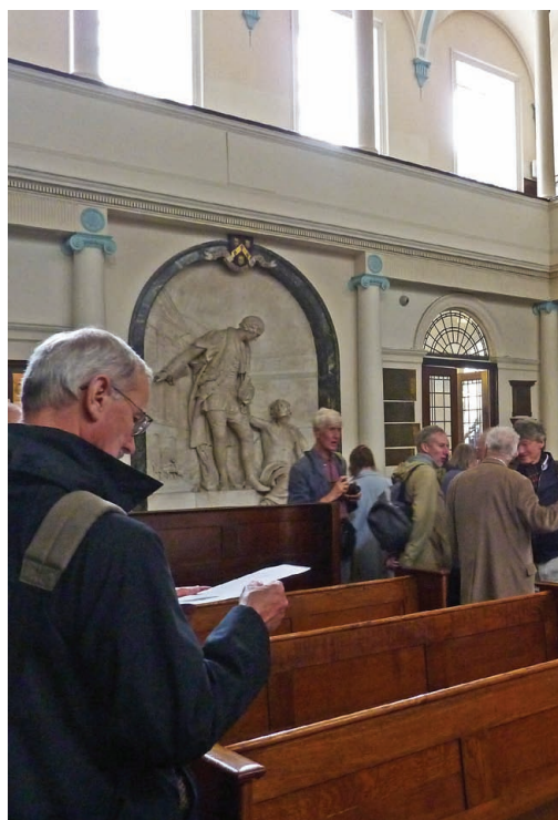
Memorial to Thomas Guy by John Bacon (1779) in the hospital chapel

We walked through the hospital and on to Weston Street. This was the final part of the walk, through Bermondsey and the area's industrial past. The other major industry here was leather tanning. The area was perfect for this because it provided fresh, running water, easy access for livestock and was down wind of the city, and a small tanning industry continued here as late as the 1960s. The last tannery, which specialised in exotic skins such as ostrich and snake, closed in 1986. We passed the impressive nineteenth-century London Leather