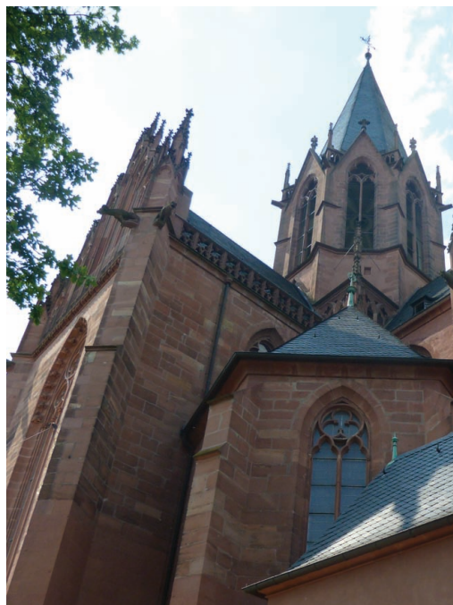
St Katharine's Church Oppenheim