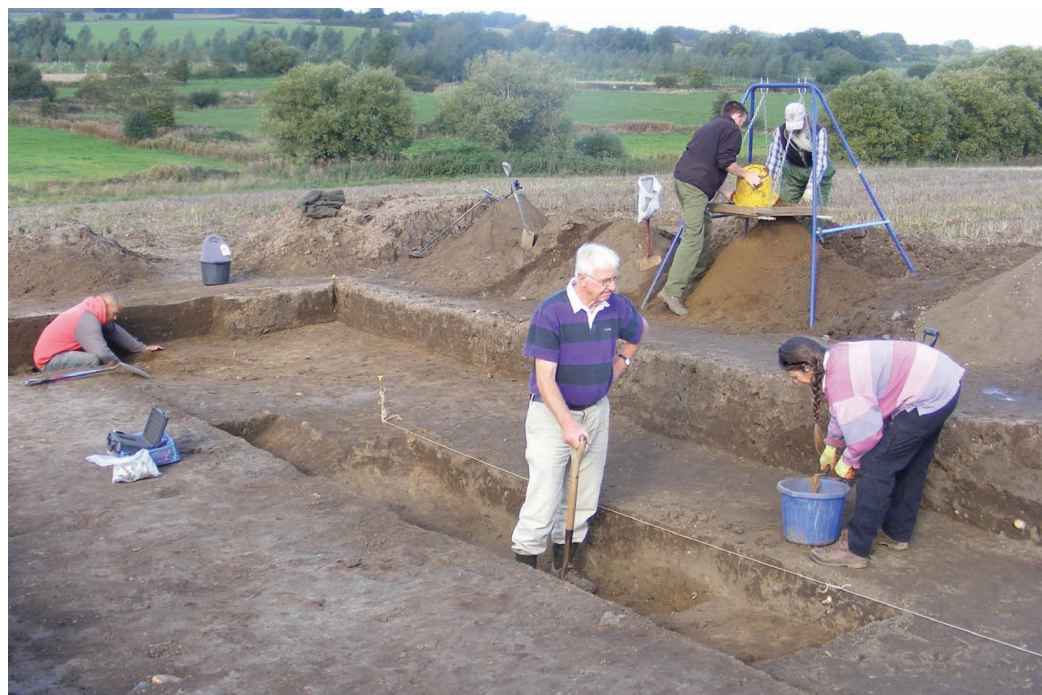
Rendlesham: ditches in Tr 6, with dark soil midden deposits, foreground

In field RLM 054: Trench 5 sampled a D-shaped enclosure. The ditch contained large pieces of wheel-thrown pottery dating to the first half of the first century AD. Trench 6 examined a major linear