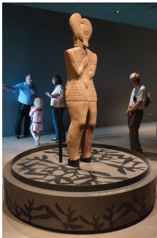
The Celtic Prince (Keltenfürst) of Glauberg (AW)

and a temple. A second theme was 'Centres of Power', principally the Holy Roman Empire and the kingdoms and principalities of Germany as they existed before the proclamation of the German Empire in 1871. Included in the itinerary were several World Heritage Sites. Frankfurt was an excellent centre from which to start our visits, and journeys in all four directions were easy and comfortable.