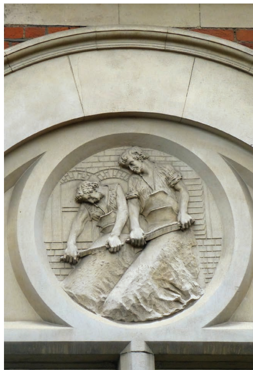
Leather-working, on the facade of the former London Leather Exchange (MO'B)