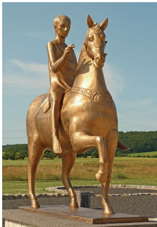
Waldegrimes: reconstruction of statue of Octavian (MO'B)

first century B.C. Its present condition presents a contrast with some of the more sanitised and tidy sites. The hill is heavily wooded and it takes considerable imagination to form a picture of its layout, as well as good boots to explore.