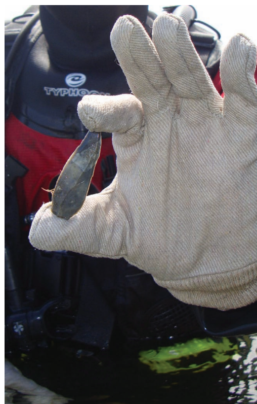
Diver at Greencastle with flint blade from c.2 m water (WF)

The study area covers two small bays near Greencastle, Co. Donegal which together have produced a collection of 1500 Early Mesolithic flints, apparently washed ashore from a submerged site. Research undertaken in 2011–12 located a small lithic concentration underwater in one bay and a submerged peat layer (dated to c.8700–9300 cal