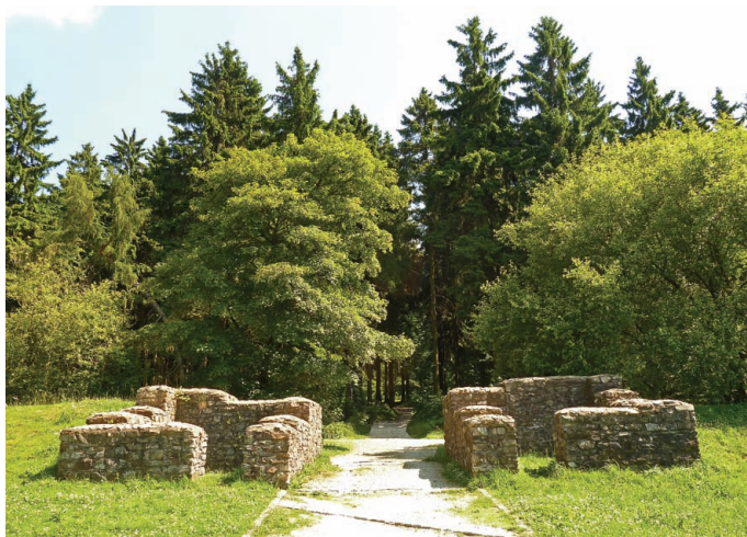
Remains of the porta decumana at Feldberg (MO'B)

of the fort, charmingly situated in a leafy clearing close to water, but completely bogus, provided welcome shade on a hot day.